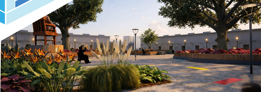
Public Square Revitalization - Moca, PR In Progress

ARCHITECTURE ENVIRONMENTAL ENGINEERING MANAGEMENT