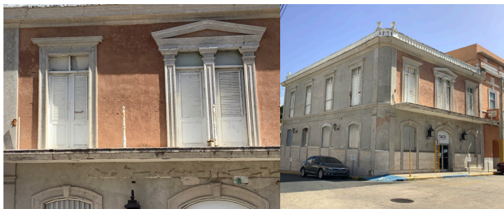
Inspection and Restoration - Arecibo, PR In Progress