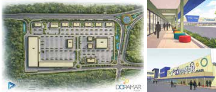
1. Doramar Plaza - Dorado, PR 2015

4. Design for the rehabilitation of an existing maritime crane into a public food court and plaza, including kiosks, seating areas, pergolas, and supporting amenities. CDBG-MIT funding.