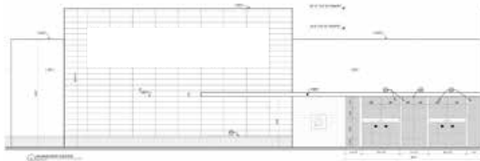
3. Department Store - Multiple Locations, PR 2023