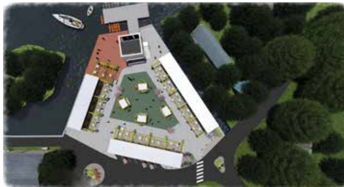
4. Varadero Food Court - Culebra, PR 2026